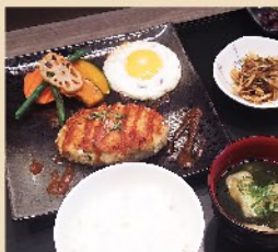
Minchikatsu Set 1,000 yen