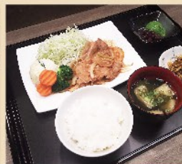
Ginger - fried pork Set 1,000 yen