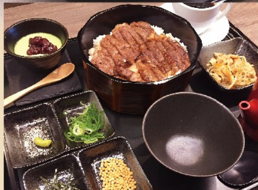
Iga beef Hitsumabushi 2,800 yen