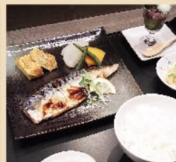
Grilled fish Set Dinner limited 1,000 yen