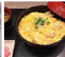
Chicken and egg Bowl 800 yen