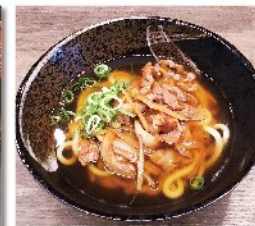
Iga beef udon 1,000 yen