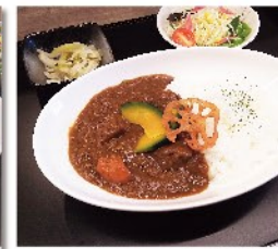
Iga Beef curry Set 1,200 yen