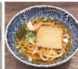
Kitsune udon 600 yen