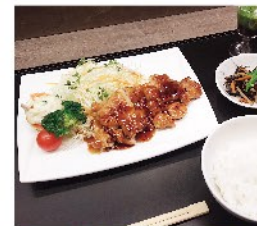
Teriyaki chicken Set 1,000 yen