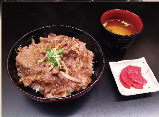
Iga beef Bowl 1,200 yen