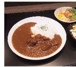
Beef curry Set 900 yen