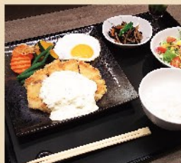
Tartar sauce Chicken nanban Set 1,100 yen