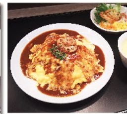
Rice omelet Set 900 yen