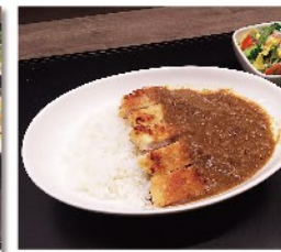
Pork cutlet curry Set 1,100 yen